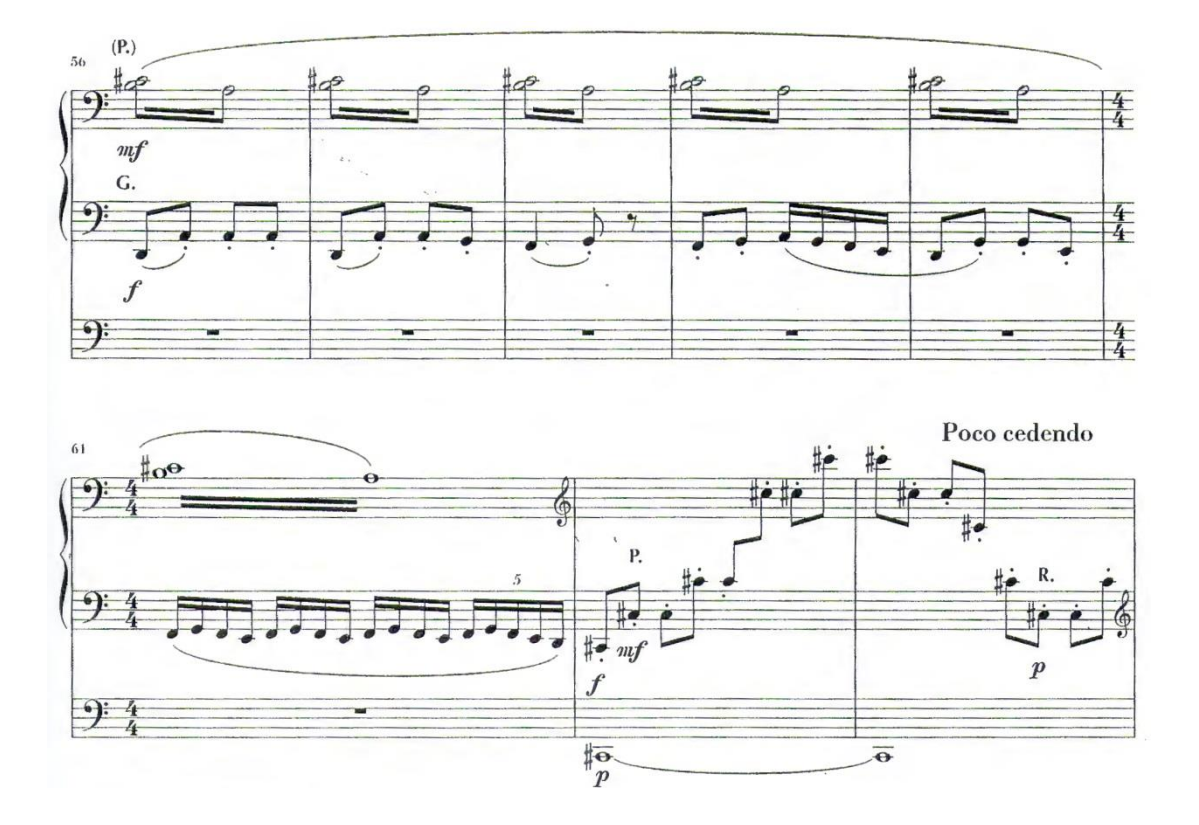
4.4. Harmony and orchestral arrangement in non-tempered scales